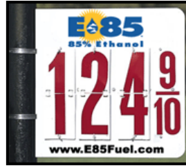
#36 Pole Pricing Sign