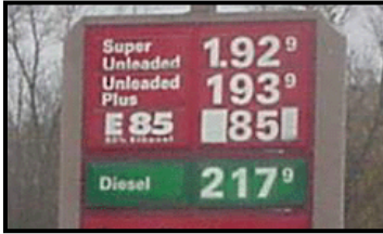
#37 Marquee Sign Insert